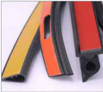
Adhesive Laminating and Custom Cutting