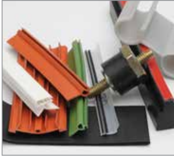
Versatile Material Capabilities