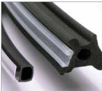
iDea® Seal Technology

Visit https://www.cooperstandard.com/industries/building-construction/hvac to view more machining and related services that Cooper Standard ISG has to offer.