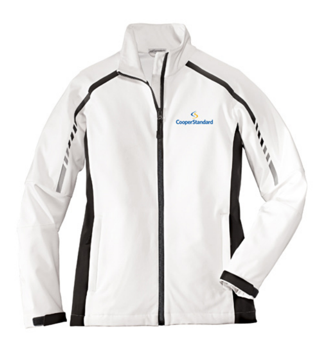
Sea Salt White/Deep Grey